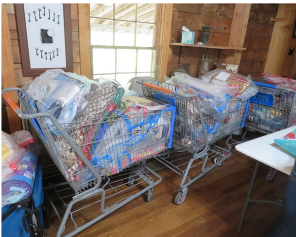
Shopping carts full of quilts for Quiltfest display