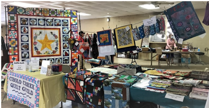
Boerne Garage Sale Display