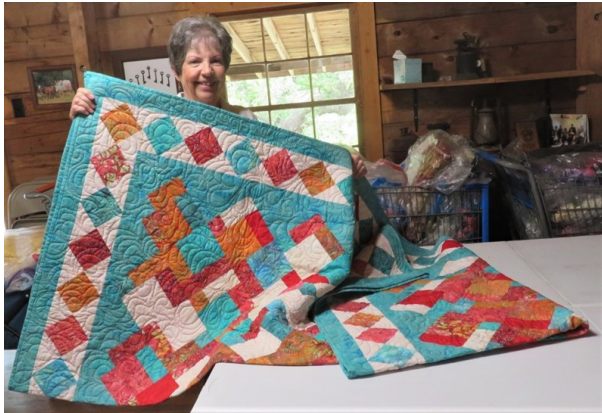
Bonnie Gates Quiltfest check-in volunteer